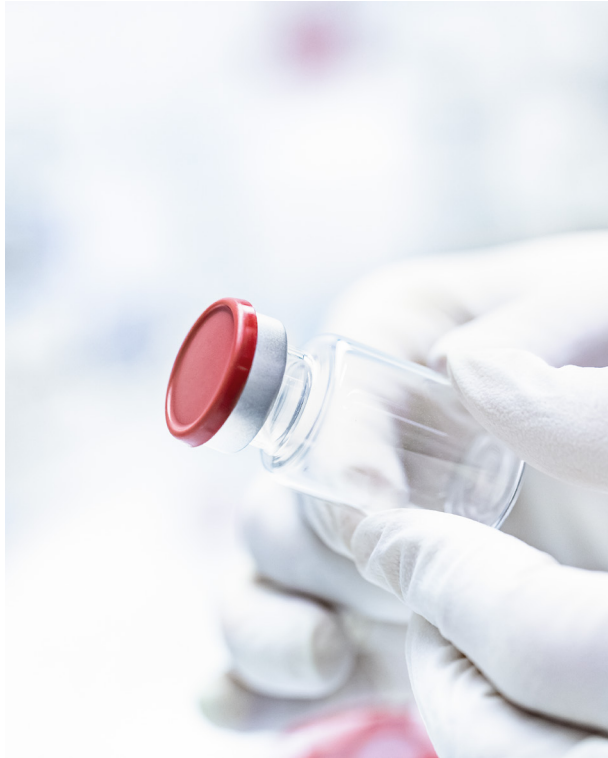
Datwyler's packaging solutions guarantee the highest degree of quality and reliability.